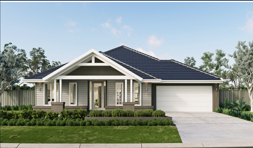
Price excludes upgrade items above standard specification such as feature render and bricks, front entrance timber decking, front entry door, brick infills above garage, external lighting, fencing, concrete paths and driveway. Façade Image may also contain items not supplied by Metricon Homes, namely landscaping and planter boxes.