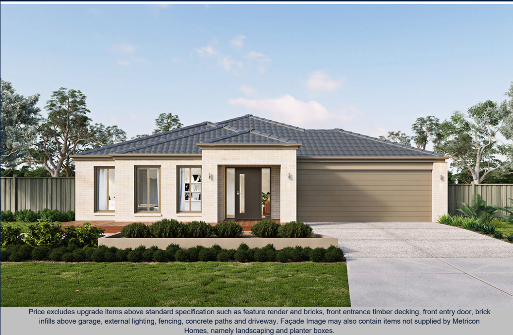
Price excludes upgrade items above standard specification such as feature render and bricks, front entrance timber decking, front entry door, brick infills above garage, external lighting, fencing, concrete paths and driveway. Façade Image may also contain items not supplied by Metricon Homes, namely landscaping and planter boxes.