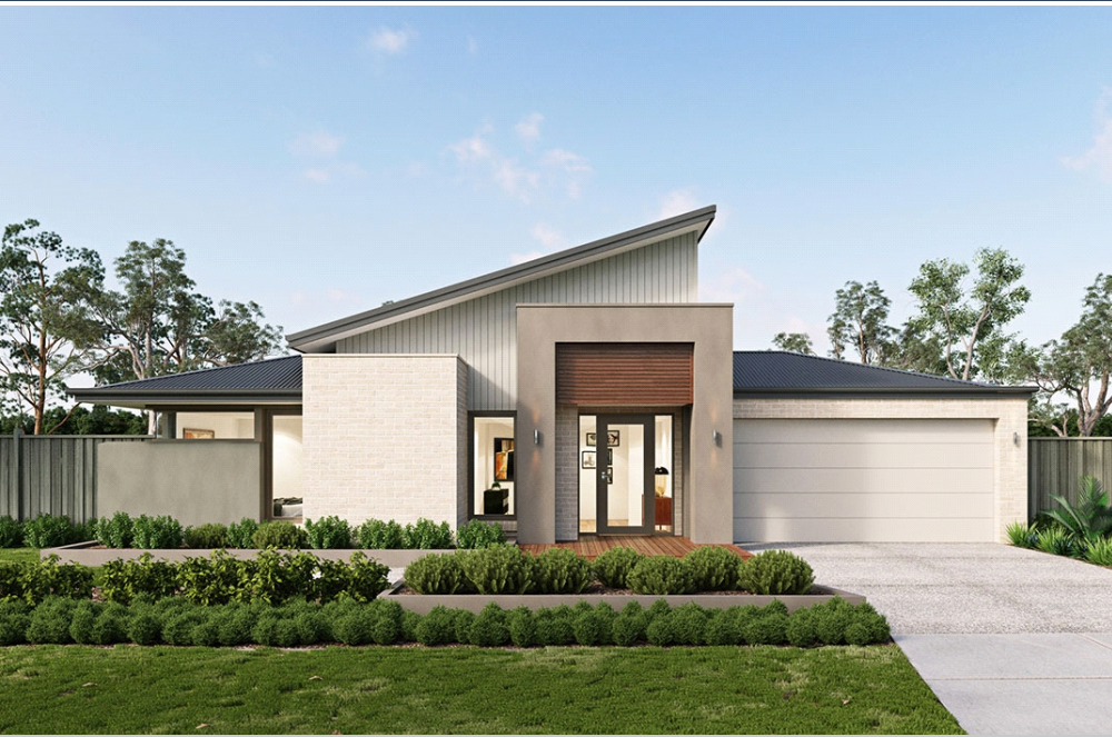
Price excludes: Fencing, Landscaping, Concrete pavers, Planter boxes, Decking