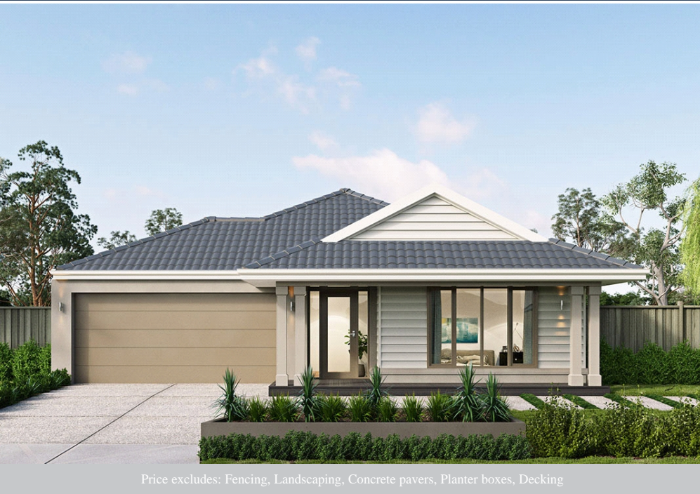
Price excludes: Fencing, Landscaping, Concrete pavers, Planter boxes, Decking