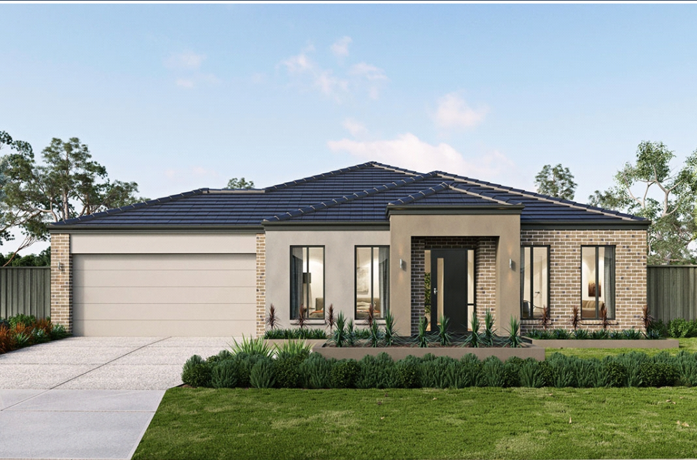
Price excludes: Fencing, Landscaping, Concrete pavers, Planter boxes, Decking