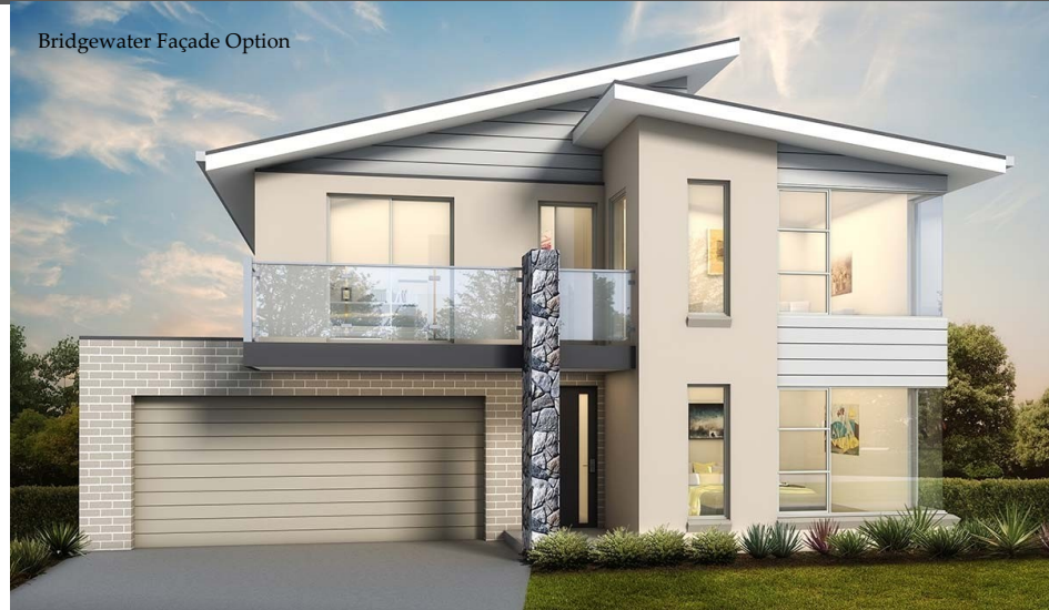
Bridgewater Façade Option